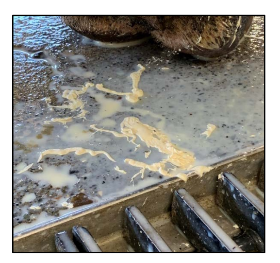
Fig. 2. Internal teat sealant residue

To differentiate cows shedding white internal teat sealant from mastitic cows while stripping, here are some tips: