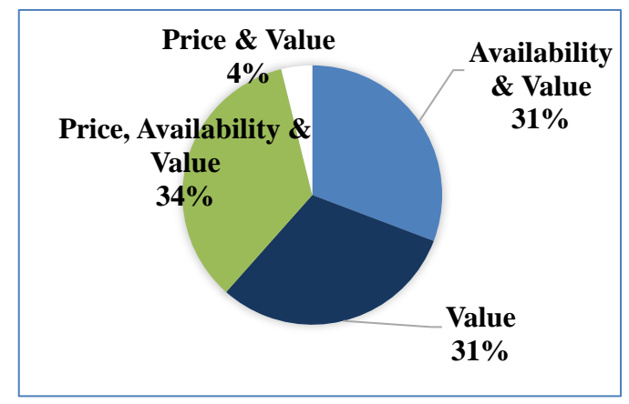
Figure 1. Reasons for incorporating byproducts into dairy rations.