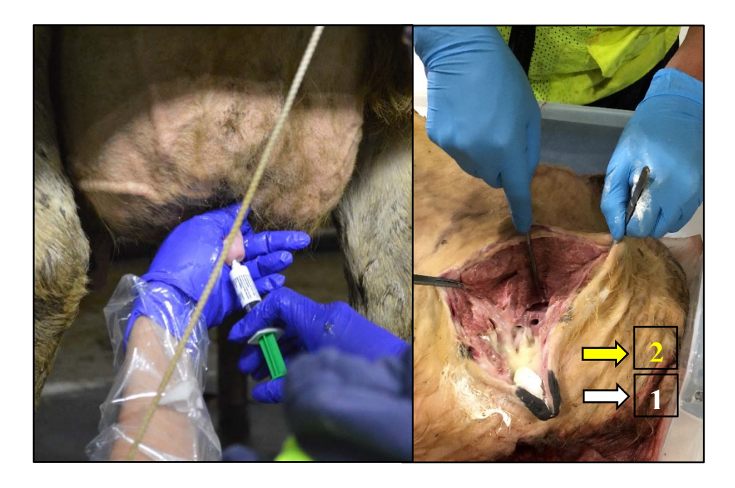
Figure 3. Internal teat sealant application and the correct localization of the sealant in the teat cistern (1) together with the dry cow antibiotic in the gland cistern (2).