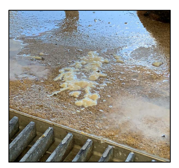
Fig. 1. Mastitis

At milking time, a healthy cow can be mistakenly flagged for mastitis due to teat sealant residue changing the normal milk appearance ( Figure 2 ). Cows treated with internal teat sealant at dry-off can shed treatment residues during the first milkings. While colored sealants are easier to distinguish from milk, white sealants can be mistaken for mastitic milk.