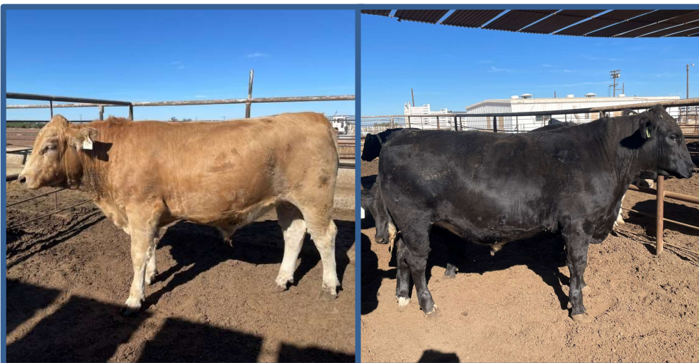
Finished Charolais-Holstein steer (left) and crossbred Angus-Holstein steer (right) one day before harvest.

Angus-Holstein crossbred steers had increased performance and improved carcass characteristics compared to Charolais-Holstein steers, however feed efficiency and dressing percentage were not different between the two breeds. Continuing to build the database of crossbred beef-on-dairy cattle in the feedlot is critical as sire may play a significant role in productivity and efficiency, as has been seen in other studies.