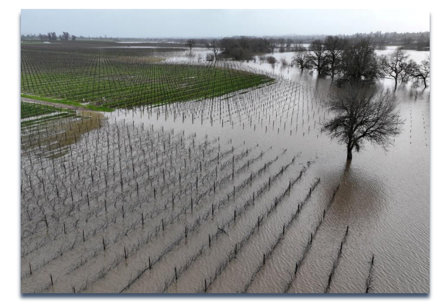
Vineyard flooded from the rain

A suite of photos and management options for the most common pest and diseases of agricultural crops can be found at the UC IPM website www.ipm.ucdavis.edu