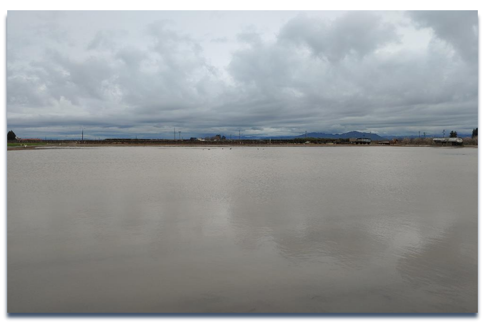
Standing Water throughout the Central Valley.

UC Cooperative Extension Advisors are local representatives of the University of California that produce and extend relevant science-based information to the public. They maintain relationships with community leaders and collaborate with personnel in other agencies in alignment with their mission as an agent of positive change and public service. They serve as resources for public and private organizations.