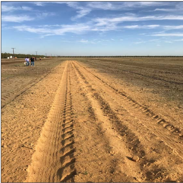
Figure 3. Anaerobic soil disinfestation substrate (ground almond hull and shell) spread on soil surface as a treatment of a total of four treatments applied to wood chip and no-chip plots.