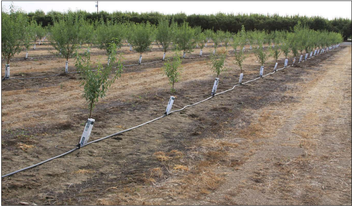
Figure 1. Responses of trees to preplant treatments in one of the initial ASD trials at the UC Kearney Research and Extension Center. Foreground, stunted trees exhibiting PRD in a non-fumigated control plot; left and right backgrounds, vigorously growing trees in preplant fumigated and preplant ASD plots, respectively.