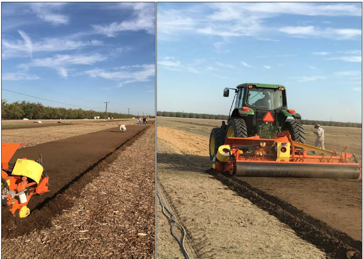
Figure 4. Incorporation of wood chips and ASD substrate (ground almond hull and shell) into the soil using a Northwest Tiller rototiller.