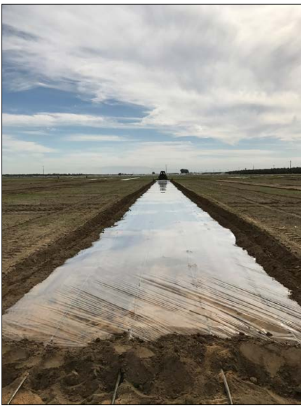
Figure 5. Anaerobic soil disinfestation plot after installing drip lines and placing TIF tarp.