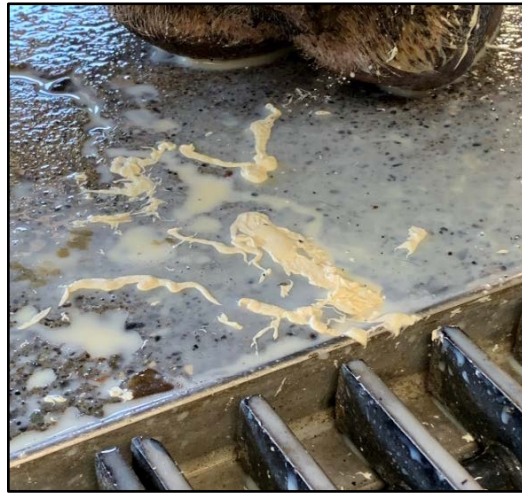
Fig. 2. Internal teat sealant residue

To differentiate cows shedding white internal teat sealant from mastitic cows while stripping, here are some tips: