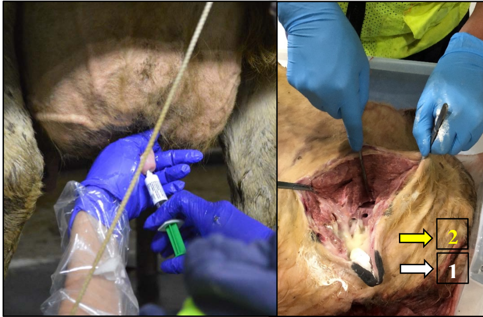
Figure 3. Internal teat sealant application and the correct localization of the sealant in the teat cistern (1) together with the dry cow antibiotic in the gland cistern (2).