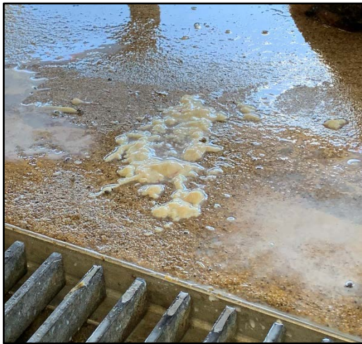
Fig. 1. Mastitis

At milking time, a healthy cow can be mistakenly flagged for mastitis due to teat sealant residue changing the normal milk appearance ( Figure 2 ). Cows treated with internal teat sealant at dry-off can shed treatment residues during the first milkings. While colored sealants are easier to distinguish from milk, white sealants can be mistaken for mastitic milk.